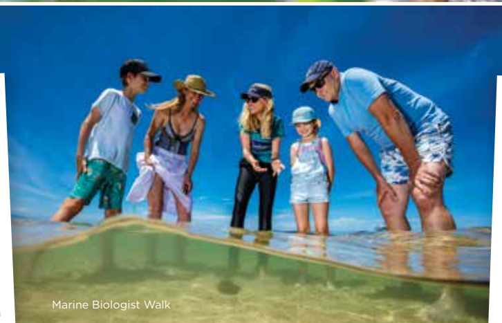
Marine Biologist Walk