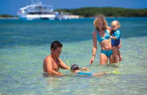
Soak up paradise under a beach umbrella