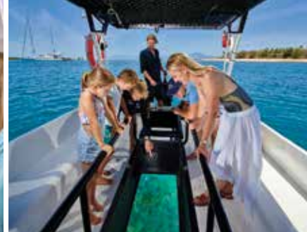
Glass Bottom Boat