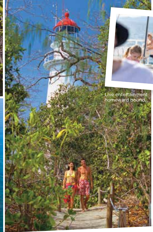
Live entertainment homeward bound.