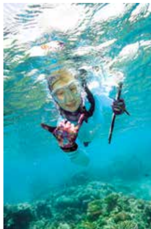
Citizen science! Opportunity to observe and participate in a Reef Authority monitoring survey.