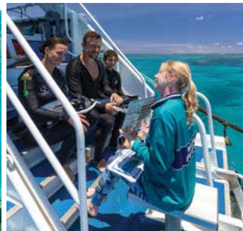
Expert marine biologist interpretation at each site.