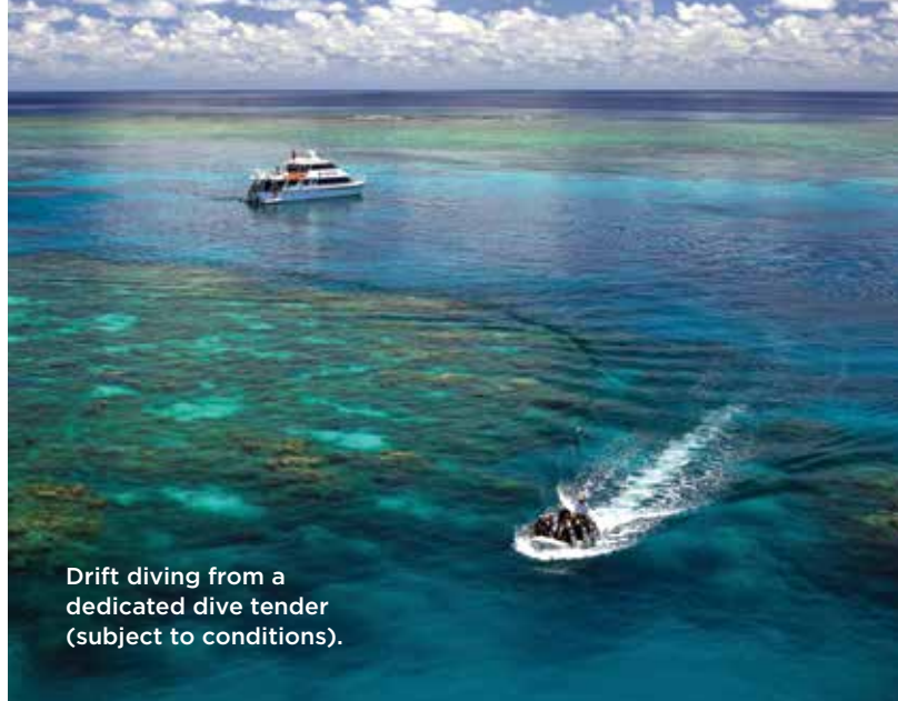
Drift diving from a dedicated dive tender (subject to conditions).