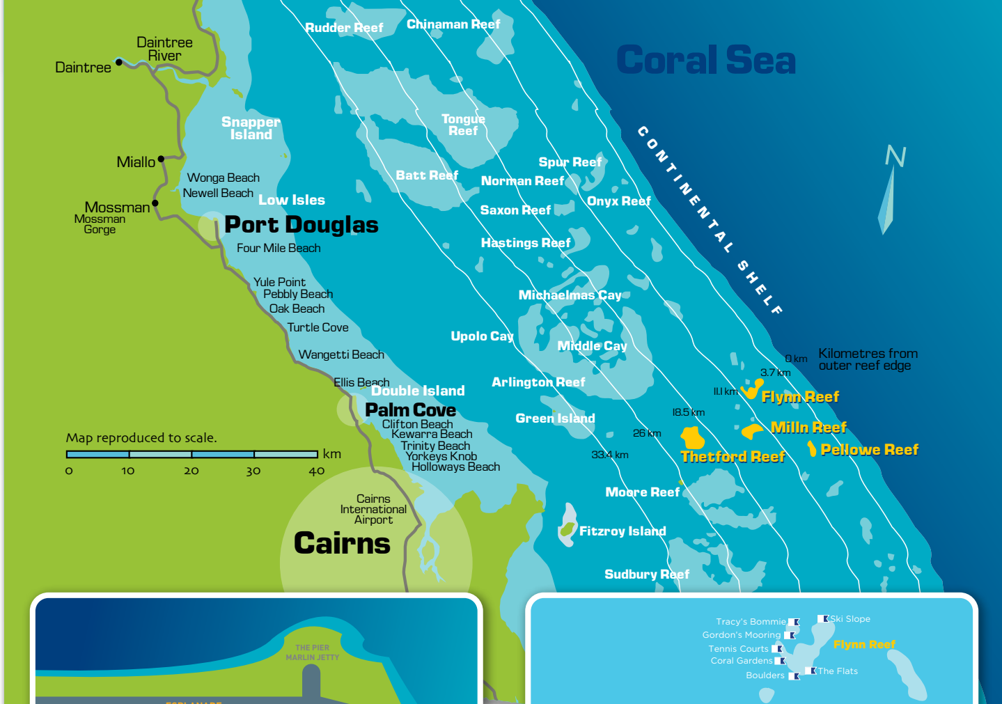
Map reproduced to scale.