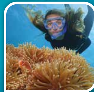
Snorkelling with Nemo.