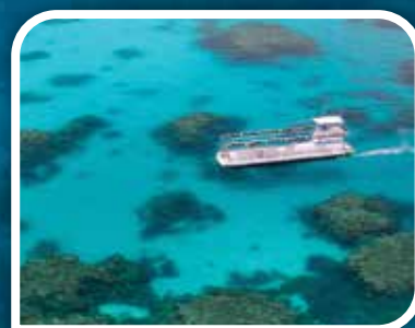
Enjoy an informative semi-submarine voyage around the coral reefs.

Advice for Water Activities The minimum age for scuba diving and Oceanwalker is 12 years, however some older age persons may require a doctor's certificate. Certain medical conditions, medications and height restrictions may preclude some people from participating in optional in-water activities. For advice and more information, contact our office or see our website. After a single dive a wait of 12 hours is recommended before ascending to an altitude of 300 metres or greater. An interval of 24 hours is suggested for multiple dives.