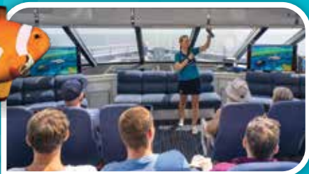
Marine Biologist Presentation.