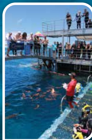
Fish School! Watch from the platform.