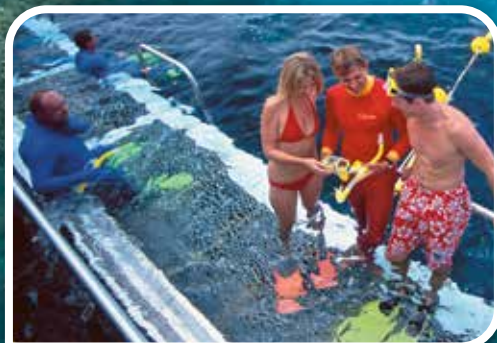
Our crew are there to help you get the most from your day. Snorkelling equipment is provided.