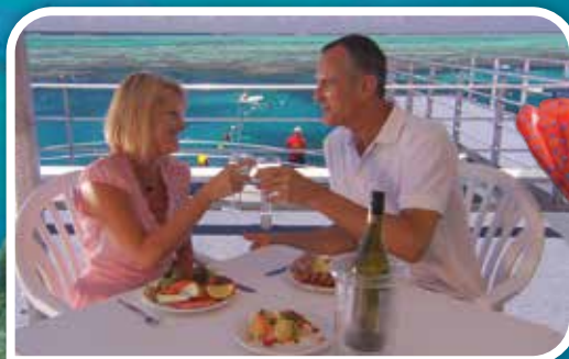
Enjoy a sumptuous buffet lunch from the comfort of tables located on the platform or onboard the vessel.