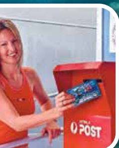
Postcard from Australia Most remote post box right Agincourt Reef!